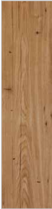
Desert Oak JPT4406LL