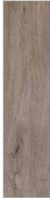
Frost Oak JPT4403LL