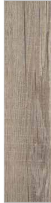
Mystic Oak JPT4413LL