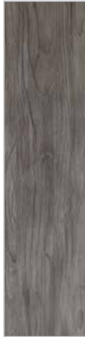
Thunder Oak JPT4405LL