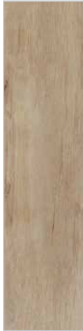
Hazen Oak JPT4404LL