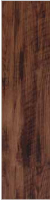
Woodland Oak JPT4411LL